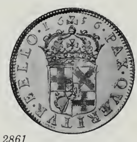
Lot No. 2861

Oliver Cromwell, Lord Protector, 1656-1658. Gold Broad, 1656 by Thomas Simon. Obv. Laureate bust of Cromwell 1. No drapery. Inscription OLIVAR D.G. RP ANG.SCO. ET HIB &C PRO. Rv. Crowned square shield of the Protectorate. Inscription PAX QVÆRITVR BELLO. 9.07 Grams. S.3225. Extremely Fine and rare. (SEE COLOR PLATE) (6,000-6,500)